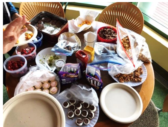
A lovely "spread" of sweets brought by various members for an after-round treat.