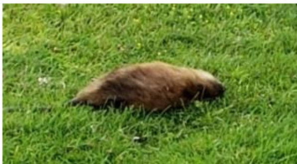
Another critter trying to play through.