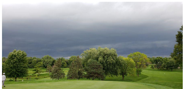
Approaching storm photos by Sandy Denault .