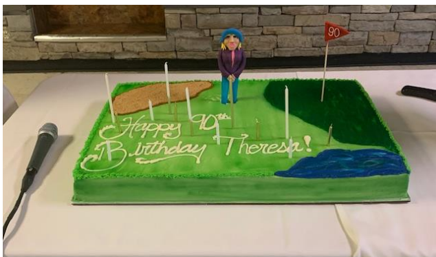
Now that is a cake!