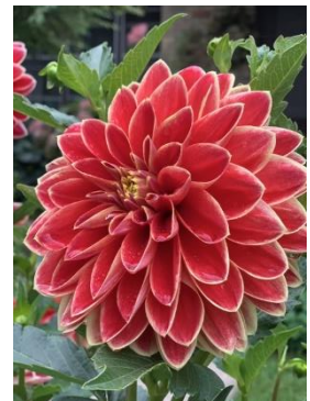
These dahlias and vanilla strawberry hydrangea are photos from Wendy Lane's garden. Her cute frog wisely wears a mask.