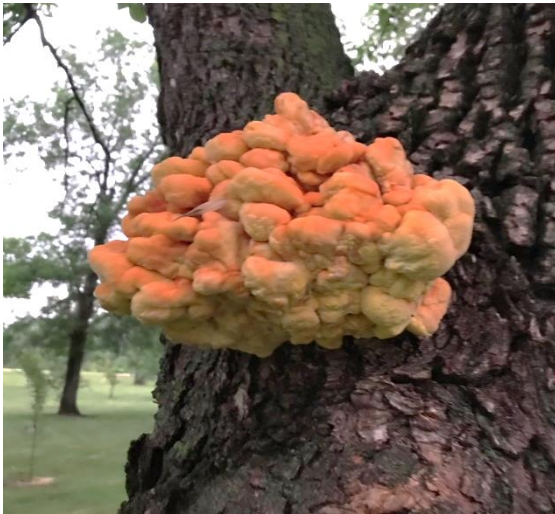
That thing is called a Chicken in the Woods. It is edible...if, in fact, you are a chicken in the woods.

Thanks to everyone for submitting flower photos! We can longingly look back at these photos in January.