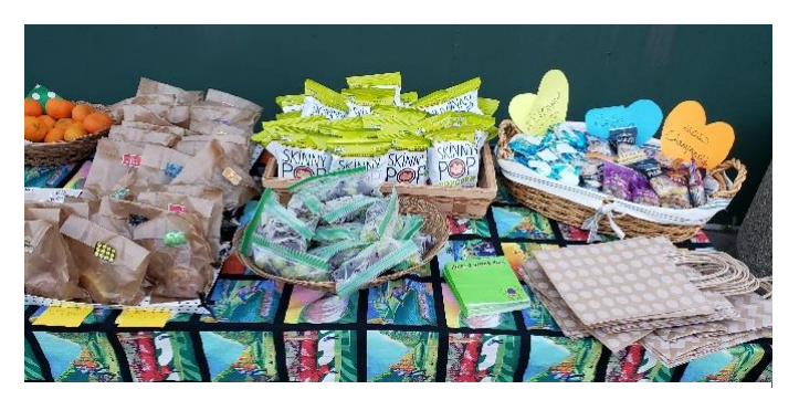
It is always good to start a round of golf with breakfast. Thanks to the committee for the grapes, nuts, popcorn, and a breakfast muffin. And of course, water for a hot and humid day. It kept us all going.