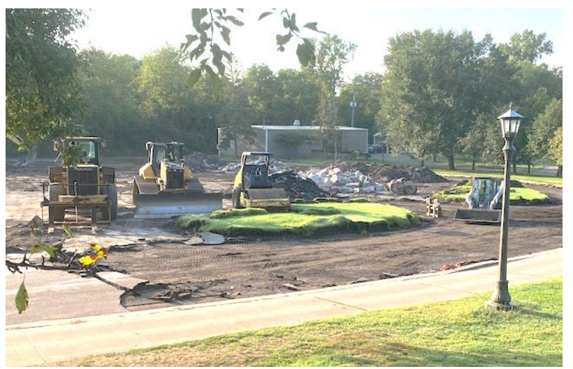
This is a photo from early in the morning on Day Two! The pain of parking in the Butterfly Parking Lot will be soon forgotten when this project is completed. Three cheers for the work crew!