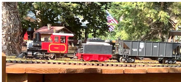
All aboard! This model train is set up in a yard in Sandy Denault and Angie Guillaume's neighborhood. Chugga chugga choo choo!