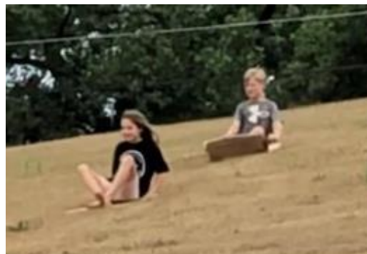
Kids were spotted sliding on the #11 hill. It was all fun until someone reported it and that was the end of that. 😞