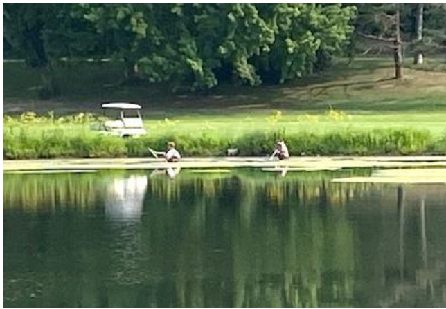
Under the heading of worst job ever, this would be near the top. What were they searching for? We were afraid to ask.