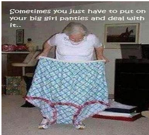
Next time you are in "the junk" on #8, pull these undies out of your bag and put them on. If nothing else, they will make your playing partners laugh.